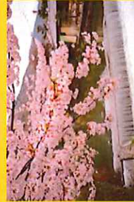
Cherry blossom viewing (hanami)—a popular springtime custom in Kyoto.

Kyoto is renowned throughout the world and within Japan as the country's cultural heartland, with a rich treasury of history and tradition. Approximately twenty UNESCO World Heritage Sites are located within Kyoto Prefecture. In addition to numerous temples, shrines and other cultural sites exemplify Japan's unique aesthetic sense. Students account for approximately ten percent of the Kyoto city's population, providing a vibrant, youthful counterpoint to its wealth of history and tradition. The city boasts a vibrant social scene replete with countless distinctive restaurants and cafes. Kyoto provides the perfect setting for all aspects of an enjoyable and productive student life.