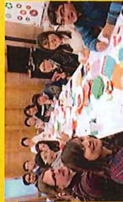
Origami workshop at Student Lounge KIZUNA.