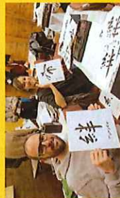
Calligraphy workshop at Student Lounge KIZUNA.