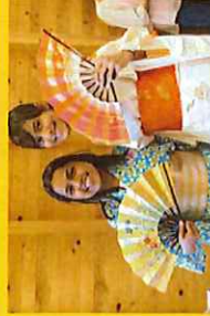
Students wearing kimonos at a KIZUNA Event.

The International Service Office provides international students with information about visa requirements, and assists with visa applications, applications for university accommodation, and other aspects of daily life in Japan. The office is conveniently located in the same building as the international student dormitory, and is available to students during office hours.