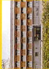
Yoshida International House

Kyoto iUP students are provided with accommodation in the university's international dormitory. The dormitory's clean, modern rooms include individual cooking, bathing, and toilet facilities, as well as a refrigerator, air conditioning, free internet access, furniture, and bedding. The international house also has a communal area where students can interact and socialize.